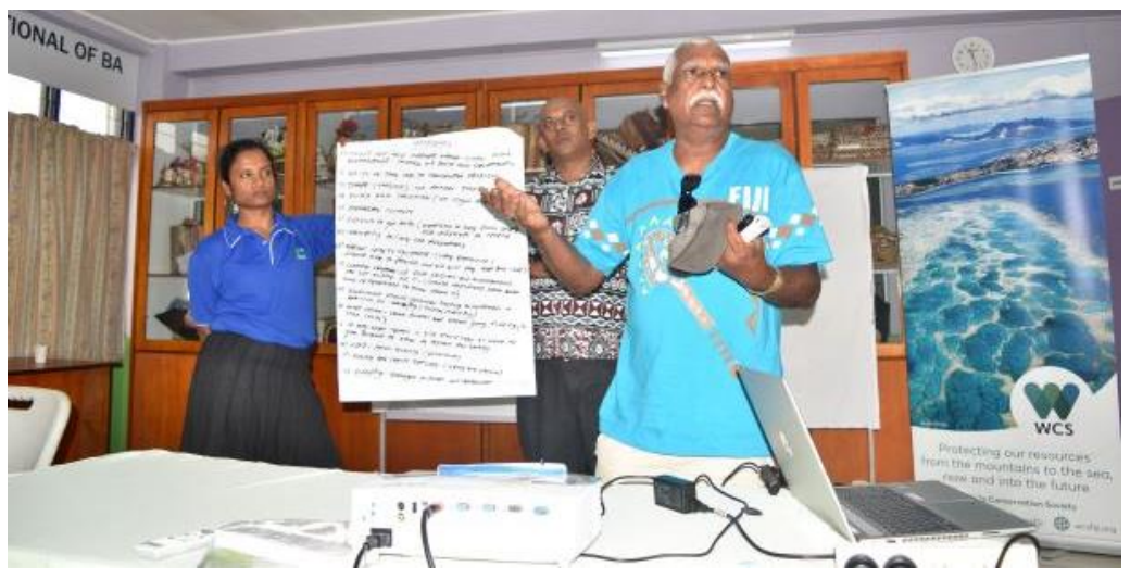
Indo-Fijian fisher of Ba providing comments at the workshop consultation for the Indo-Fijian fishing communities.

The completed report will provide guidance to the Ministry of Fisheries and partners on how to better support these important fisheries groups.