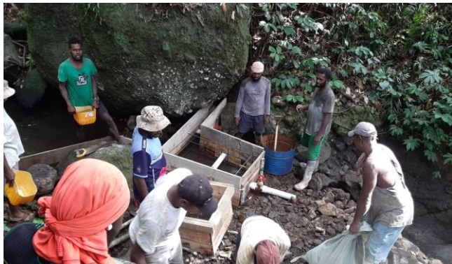
Villagers of Bureta District building the collection box with a sedimentation chamber at the dam site.

Two urgent interventions were carried out in 2020 with the first in the Bureta subcatchment. A new dam with a collection box and a sedimentation chamber was built to help reduce sedimentation and improve the quality and supply of drinking water to the three villages of Naviteitei, Nasaga and Tai, a settlement, a health centre, a school and the Levuka airport. Two reservoirs in the Bureta sub-catchment were refurbished to improve access to water supply for over 400 people. In November, the villagers with support from the WISH Fiji project, Fiji's Mineral Resources Department, the Bua Provincial Administrator's Office, Bua Provincial Council Office and village-level Water and Sanitation Committee, repaired the broken solar pump for the Tavulomo Village in Dama District in Bua Province, restoring their primary source of water. In the aftermath of Tropical Cyclone Harold that passed through Fiji in April 2020, the Ministry announced an outbreak in the leptospirosis, typhoid and diarrhoea (LTD) cases in cyclone affected areas. To help curb the outbreak, WISH Fiji joined the fight against the LTDs by cleaning the St. Giles Hospital in Suva.