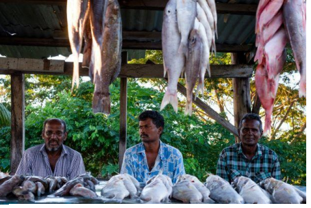
Indo-Fijian fishers selling fish by the roadside stall.

document the impact of COVID-19 on the iTaukei coastal communities and the Indo-Fijian fishing communities. The studies were intended as a first step to inform other more extensive surveys (once national restrictions are lifted) or emergency responses. The data collected across ethnic groups, were examined through a gender lens. The results of this