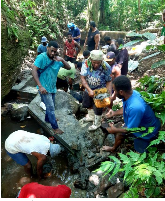
Villagers from Bureta District on Ovalau Island help build the dam.

Community engagement and field work resumed for WCS Fiji staff in mid-July after the Fiji Government eased COVID-19 restrictions on travel and gathering size. Staff presented back data from the baseline surveys to the 29 communities. The data highlighted risk factors that influence the prevalence or susceptibility of a community to water-related diseases. The data was used to assist in the development of the WSSPs and the WSSP process was used to assist communities in identifying other interventions to improve their water and sanitation infrastructure. Through this process, land management practices such as agriculture, forestry and livestock-keeping that require modification or improvement to further minimise and prevent disease risk to communities, and ensure ecosystems are healthy and productive will be identified.