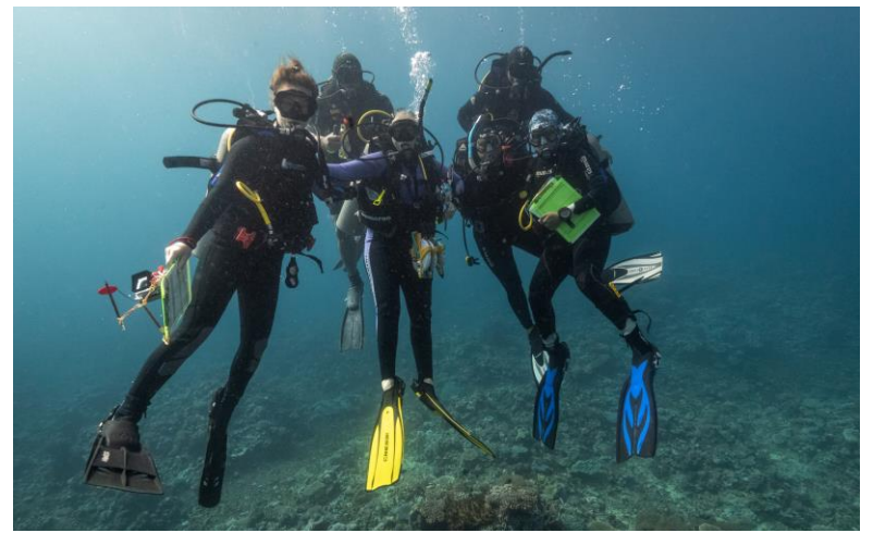
Marine scientists during the science expedition in September 2020.

Post cyclone surveys conducted in 2016 to assess and evaluate the impact of the cyclone and recovery potential of two coral reef systems found that the cyclone's 233 kilometres per hour winds and storm-surge induced waves damaged the two reef systems and communities that depend on them for food and livelihoods. In September 2020, a WCS led team of marine scientists surveyed the Namena Marine Reserve and Vatu-i-Ra Conservation Park to record any changes to the reefs since the 2016 Cyclone Winston.