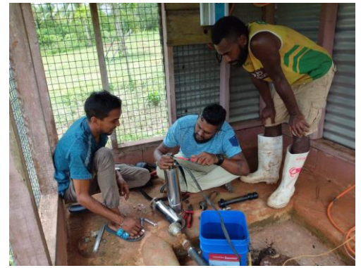
Repairing of the borehole pump at Tavulomo Village, Dama District, Bua Province.