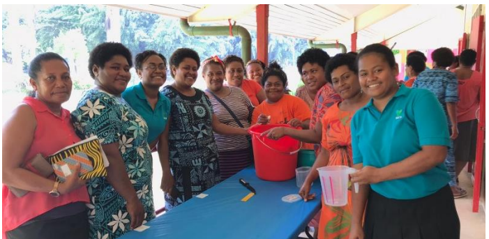
Participants of the Women in Fisheries training in Labasa with WCS staff getting ready for their practical session.

In November, women seafood vendors from the Labasa and Nabouwalu markets and communities including Tavulomo, Tiliva, Tavea and Kavewa villages of Bua Province were engaged in a three-day Women in Fisheries training conducted by WCS. The training was aimed at improving the capacity of women fishers to process, handle and sell seafood to domestic markets. It provided a platform for