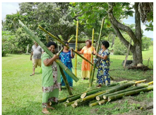
Preparing bamboo growing in their village as building materials for their mud crab pens.

At the beginning of the year, WCS introduced the mud crab project to 13 villages in Bua Province. Free, Prior and Informed Consent (FPIC) process was subsequently conducted in the four villages that indicated interest to pursue the project, namely Tavulomo Village in Dama District, Bua Lomanikoro and Tiliva Village in Bua District and Tavea Village in Lekutu District. This was followed by a gender and risk assessment of the villages and a scoping exercise.