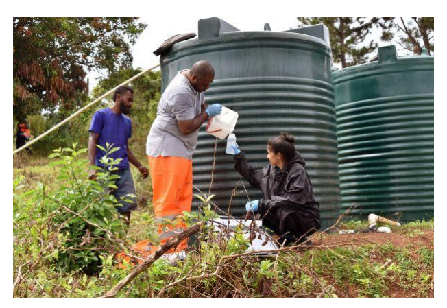
WISH Fiji field staff collecting water sample from the community tank.

4. Strengthen the implementation of policies to reduce land-based pollution.