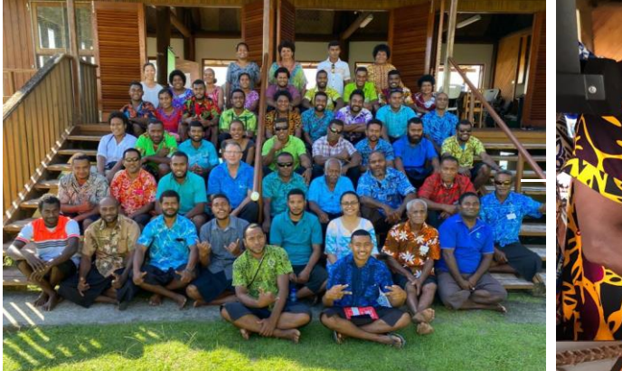
Participants of the pearl farm business planning workshop.

In December, a pearl biology and pearl farming techniques training was conducted by SPC. This project is expected to economically benefit more than 180 people from the village as the farm grows to supply the pearl meat to potential markets which JHP is working on developing. If found to be a viable livelihood project, the process will be fine-tuned to be replicated in other villages as it (i) improves economic livelihoods (ii) provides opportunities for employment and development, and (iii) supports non-extractive sustainable fisheries and protection of the environment.