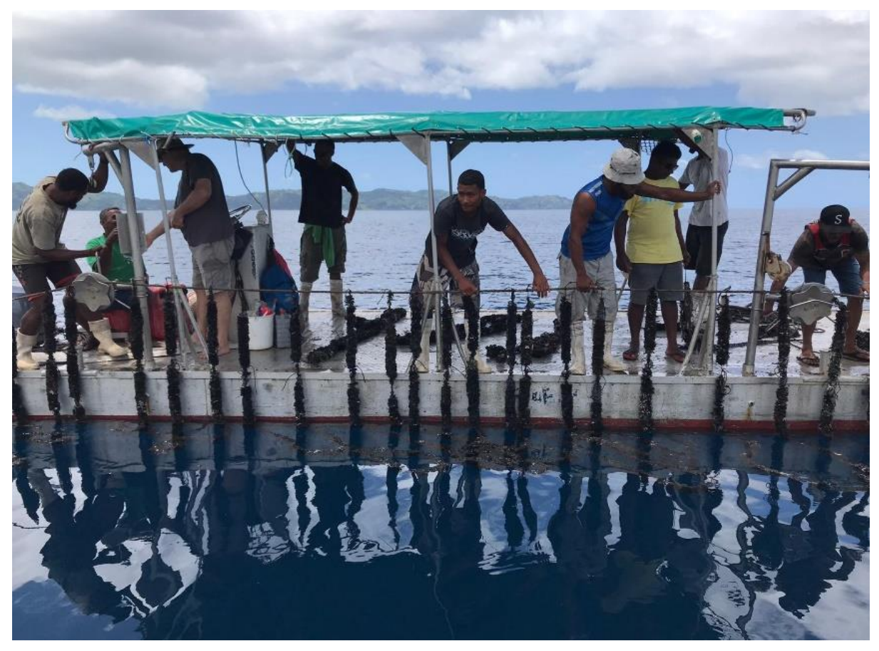
Installing the spat collectors onto the Va'ulele community farm.

Va'ulele Village in Wailevu District, Cakaudrove Province has established the first community pearl meat oyster farm in Fiji through a private sector-community partnership with J. Hunter Pearls Fiji (JHP) as the private sector partner, the Pacific Community (SPC) providing technical knowledge and WCS facilitating the development of the community. A series of workshops and trainings were carried out to build capacity of the villagers and pearl farm team. In August, WCS conducted a financial literacy and business planning training for the community to help understand the business and financial aspects of the project and the setting up of a Va'ulele pearl farm committee. The pearl oyster farm infrastructure was installed within the village iqoliqoli (traditional fishing rights area) in October and the first batch of 1,000 metres of spat collectors were deployed the following month.