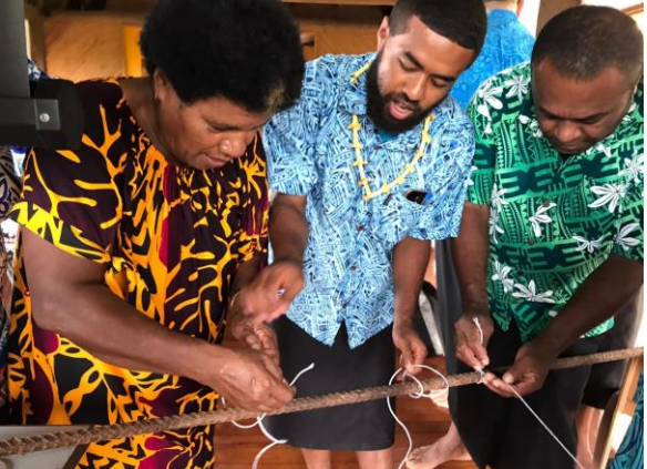
Learning how to tie the correct knots during the pearl farm technical workshop.